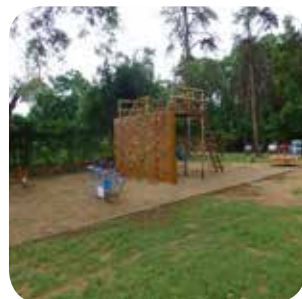
Hillview Int. Primary School