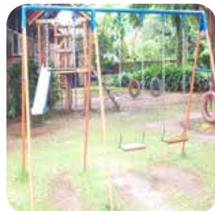
Lilongwe Golf Club