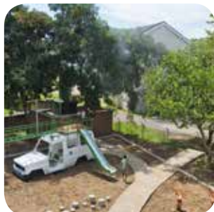
Beit cure Hospital

“Our playground equipment is popular in the whole of Malawi”