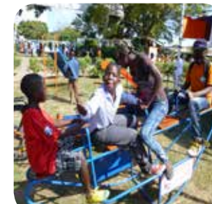
Will this be YOU?

Sakaramenta manufactures high quality hospital furniture in Blantyre. In collaboration with doctors in Malawian hospitals we developed ten products; that are often used, need a simple design and have to be high standard.