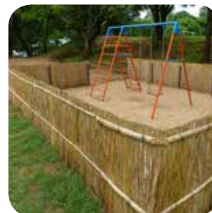
St. Andrews Inter- national Primary School