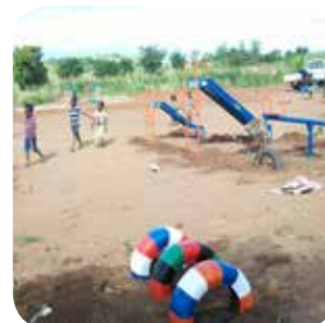
Chotokwa CBCC - Chiradzulu